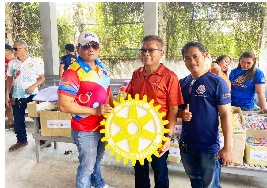
RCDS is ably represented during the RI Day of Service on Mental Health Awareness at the NOPH Psychiatric Ward in barangay Talay.